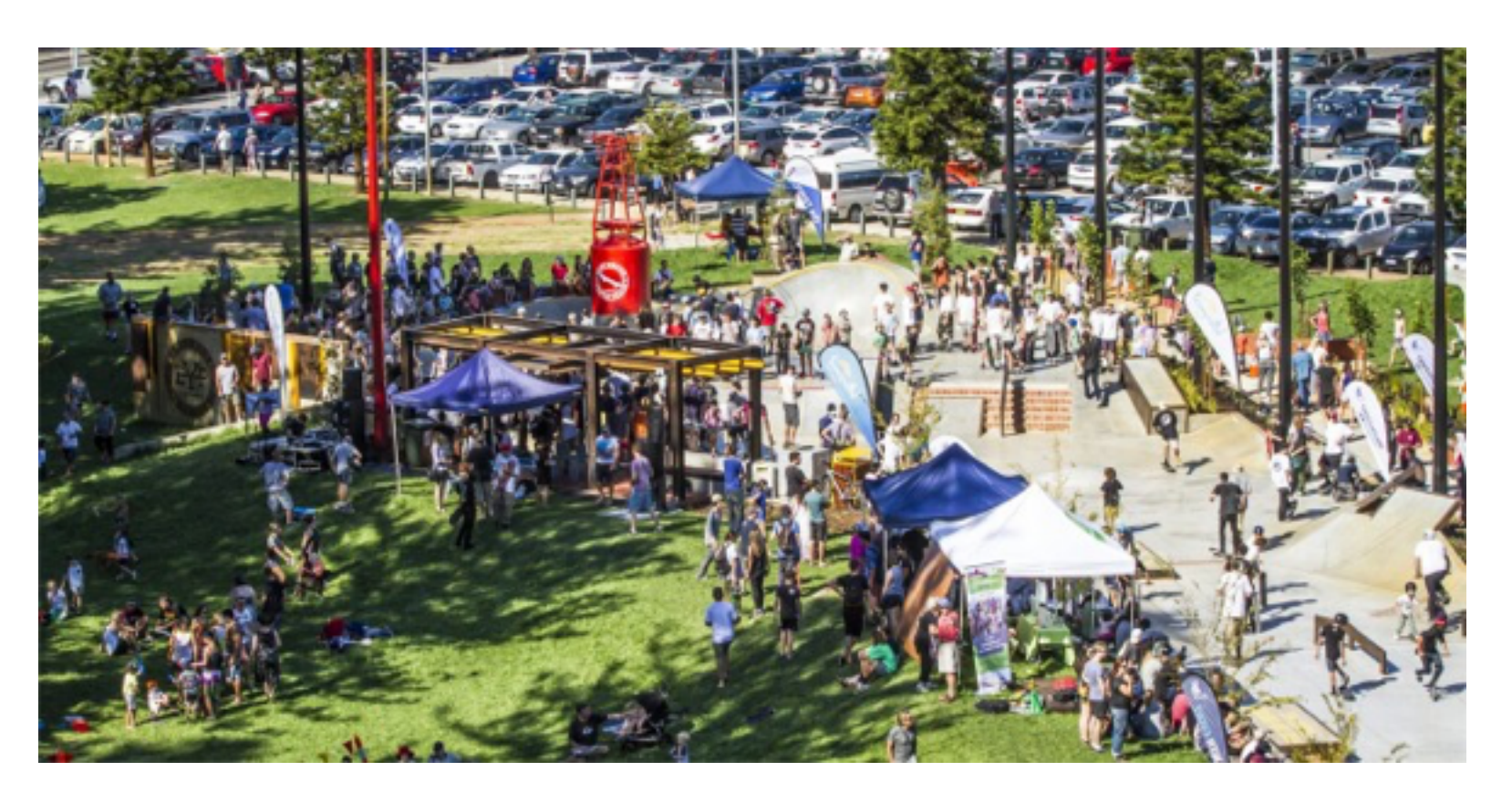
Fremantle Esplanade Youth Plaza, Australia

'young people are highly articulate about political issues, but a very strong sense amongst respondants was that they felt marginalised or excluded from political decision-making or debates' (Harris, 2007 Fremantle)